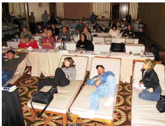
Padded lounges in the front, standing room in the back.

“FDA approved the clinical trial for the Cervitech PCM disc in December. Hopefully, patients will be enrolled in the study and surgeries will be performed within the next few weeks,” Regan said. “Cervical disc replacement is strongly indicated for radiculopathy and myelopathy.”